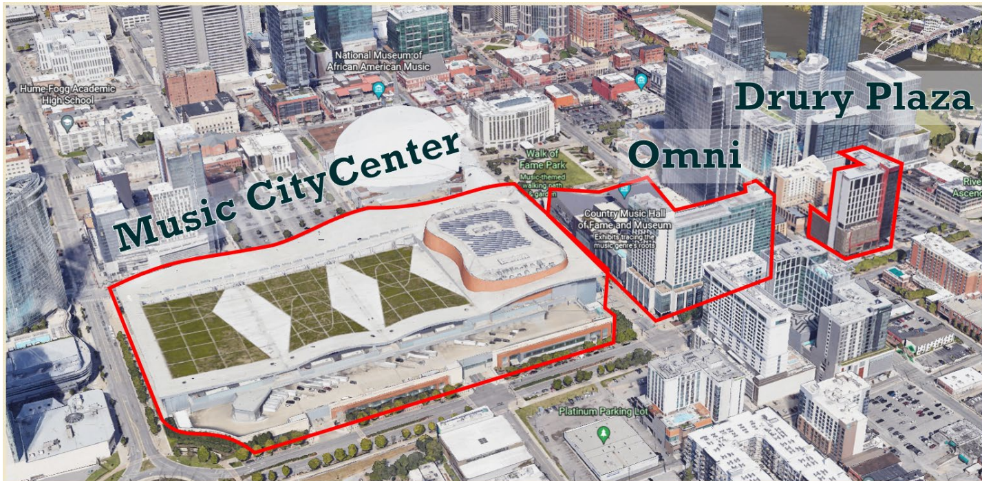
Figure 1- IPAC24 venue and hotels

We will only be accepting exhibitor registrations through the online portal ( www.ipac24.org ). Booths will be assigned on a first-come, first-served basis as noted by the date of receipt on the application and reservation deposit as recorded by the online portal. Exhibitors are encouraged to visit the conference website for updates and assignments, which will be kept as current as possible.